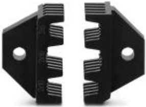
Replacement die for CRIMPFOX 16R TWIN

Please be informed that the data shown in this PDF Document is generated from our Online Catalog. Please find the complete data in the user's documentation. Our General Terms of Use for Downloads are valid ( http://phoenixcontact.com/download )