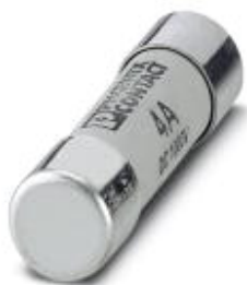
Fuse, 10.3x38 mm, up to 1000 V DC, gPV characteristics

Please be informed that the data shown in this PDF Document is generated from our Online Catalog. Please find the complete data in the user's documentation. Our General Terms of Use for Downloads are valid ( http://phoenixcontact.com/download )