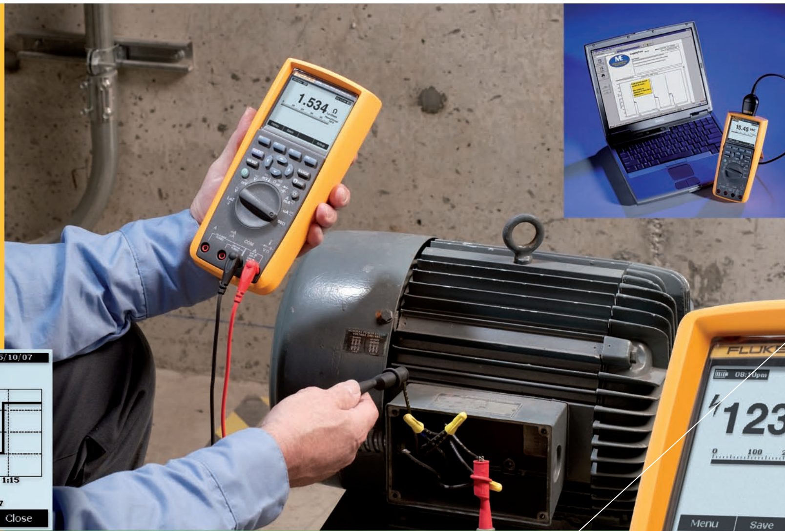
Transfer data to PC using optional cable and FlukeView Forms Software