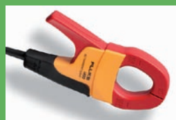
i400 Current Clamp

For more information on how the Fluke 289 True-rms Industrial Logging Multimeter with TrendCapture can help you, go to www.fluke.com/289 .