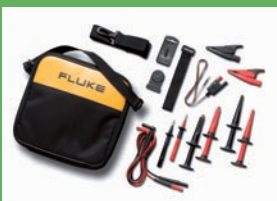
TLK289 Electronic Test Lead Kit