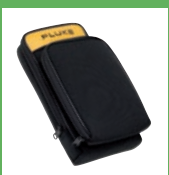
C781 Soft Meter Case