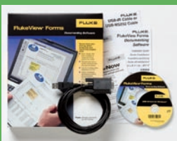
FlukeView® Forms Software and Cable

A wide array of accessories is available to help you maximize the productivity of the Fluke 289 but the following are essential for most users.