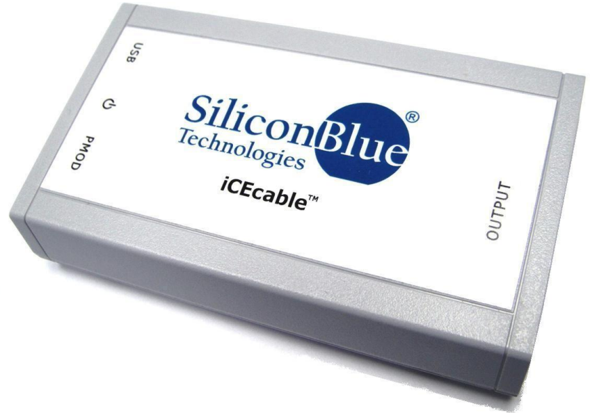
Figure 1: iCEcableM100-01